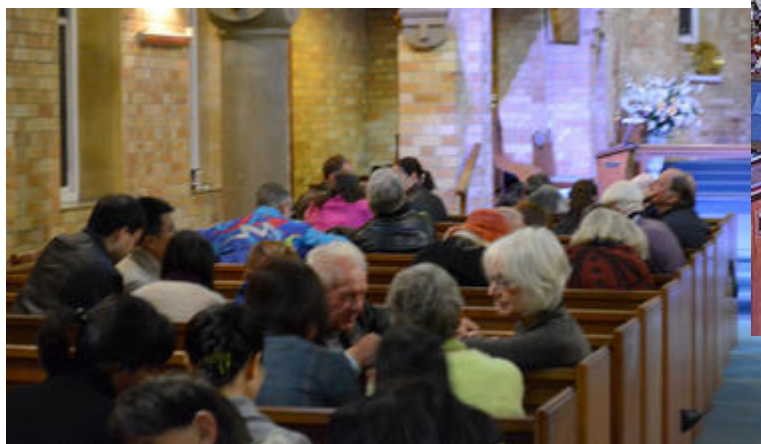
Attendees split into groups to pray throughout the night

Leaders from St John the Evangelist Church read John 14:15-20 in English and Chinese. Worship songs were played beautifully on the night by a Chinese couple from St John's; their voices lifted up the spirit of every person attending the evening - it was heaven on earth.