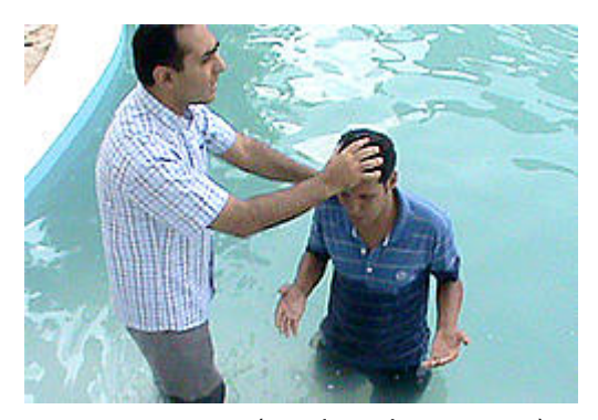
(continued next page)