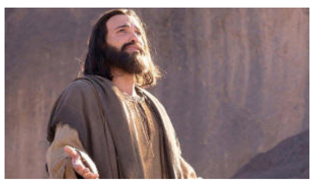
Haaz Sleiman in 'Killing Jesus' (2015)

That said, while none of the newer films have nudged their way into my all-time top ten, some of them have highlighted aspects of the Gospels that most other films miss. Indeed, one of the things I value more and more, as I study this genre, is the way some films highlight aspects of the Gospels that are often overlooked—not just by other filmmakers, but also by teachers, preachers, and other Bible readers.