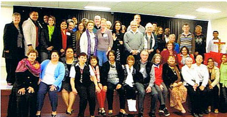
SoE "Joshua Course" participants

in parishes depends on the formation, equipping and training of both clergy and laity to meet the needs of 21st century fellow countrymen. In turn this relies on the practices of our bishops and priests, and how formation of the parishioners in the pews takes place. All Christians are called to discipleship, to fellowship with others, to some form of ministry in the Church – all for the purpose of pleasing and praising and worshipping God through the Sacraments, especially the Sunday Eucharist.