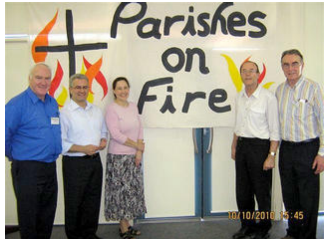
School of Evangelisation sponsored Parishes on Fire Conference organising team

Breathe in me, O Holy Spirit, that my thoughts may all be holy. Act in me, O Holy Spirit, that my work, too, may be holy. Draw my heart, O Holy Spirit, that I love but what is holy. Strengthen me, O Holy Spirit, to defend all that is holy. Guard me, then, O Holy Spirit, that I always may be holy. Amen.