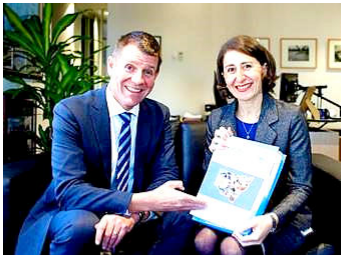
Premier Mike Baird with Deputy Leader Gladys Berejiklian

Synthetic and Ice Drug report in Sydney http://www.druginfo.sl.nsw.gov.au/drugs/list/synthetic_drugs.html