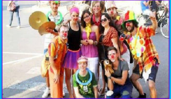
Praying to train, equip and perform with teenagers, youth, and children