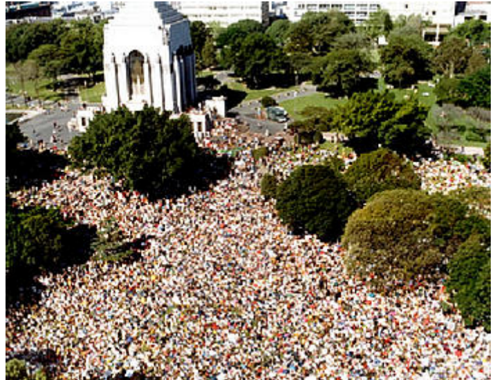
1976 Festival of Light Rally, Malcolm Muggeridge

I was thrilled in 1988 when Elaine was also elected and served with me for nearly 14 years. Together we