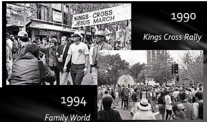
1990 Kings Cross Rally

Let us continue to pray that God's Will be done on Saturday 28th March 2015, for His Glory.