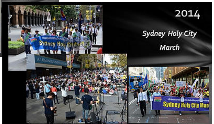
2014 Sydney Holy City March