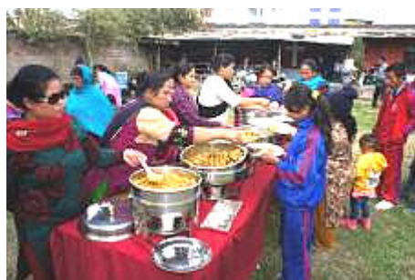
Seems like food and Christianity go together as there was plenty of food abound at event. The Youth Conference of Feb. 8th was well attended by 214 youths in a program Teens for Christ Nepal.