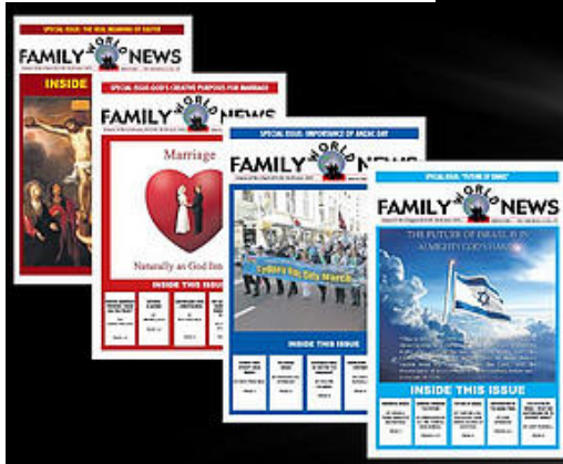
1994 Family World News 1994 - 2014