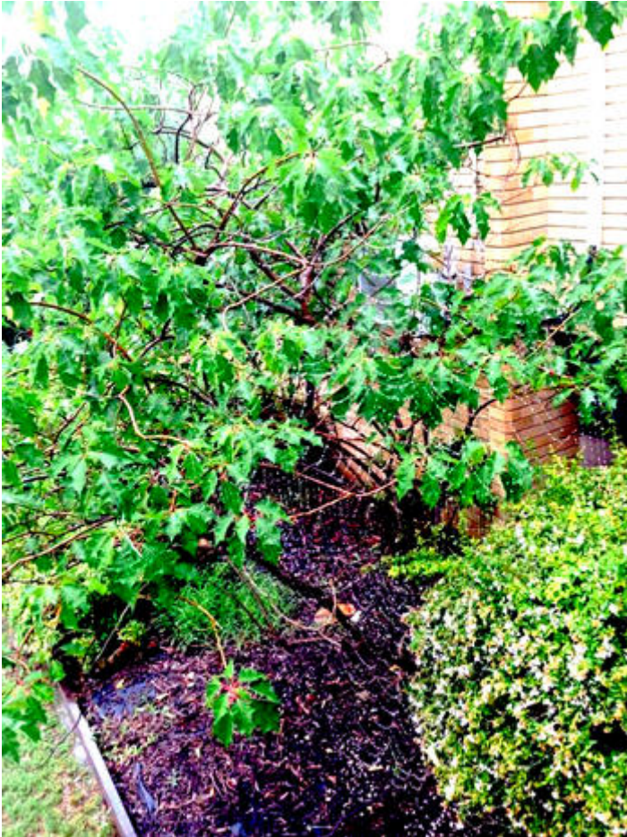
The two spider webs in this picture appeared on the Sunday morning of our recent spiritual retreat for those discerning vocations to the priesthood (22 February 2015).